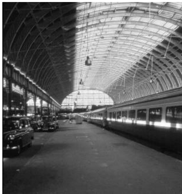
Span 4 of Paddington Station before the unsightly crash deck was erected.

We await the decision of English Heritage with great interest, but still regret that our colleagues in the Victorian Society and Twentieth Century Society did not feel able to support retention of the structure. There is, however, a wide coalition of interests keen on the retention of the structure, from railway enthusiasts through to engineers who recognise its intrinsic merits. The latest addition to this merry band is ICOMOS, the President of which recently wrote in a letter to the Chairman of English Heritage 'Although [Span 4] is a later addition of 1916 to Brunel's original three spans, it was carefully designed to compliment the original station and must therefore be seen as an indispensable element of the entire complex. In view of the fact that Paddington Station forms a part of the proposed Great Western Railway World Heritage Site, the demolition of such an integral element of the station reflecting the rapid development of railways in Britain is really not acceptable and could threaten the inscription of this site on the World Heritage List' . Simple, but true.