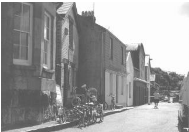
Caernarfon's Harbour Trust is seeking to demolish this entire group of buildings, industrial and residential

The buildings form an attractive group of industrial buildings, and are located within a conservation area, as well as being right next to a World Heritage Site, and next to the Grade II* listed Harbour Offices. They are surviving examples of the growth of the town in the 19 th century and of the then thriving slate industry. Their charm lies in the way they form a part of the townscape, providing a visual link between the more formal Georgian and Victorian houses of the town and the harbour.