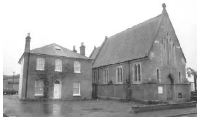
The former church and presbytery of St. Joseph's, Christchurch, threatened with carparkification.

The Church's own internal system states that the Bishop may allow a church to be used for secular purposes if agreed by the Council of Priests and the Historic Churches Committee, (Canon #1222 and paragraph 47 of the Directory on the Ecclesiastical Exemption from Listed building control). The advice of these bodies is to demolish the building, and so the Bishop is prepared to grant a decree to demolish, but not to offer it for sale on the open market or for some alternative use (as secular guidance demands). This in itself is not a reason to demolish – indeed the internal decision making processes of any organisation, church, state or private enterprise should have no bearing on the outcome of the planning system.